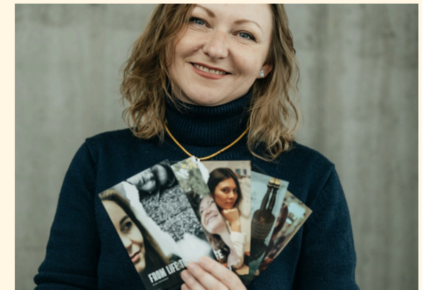
NGO networking meeting