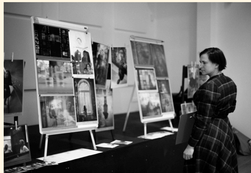
International women's day