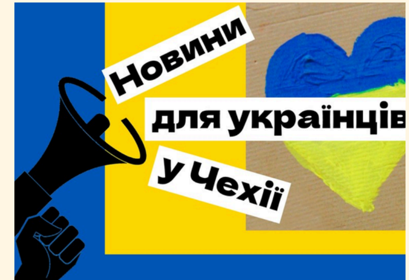
Radio Prague International