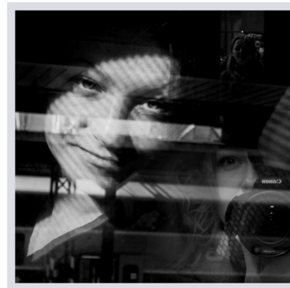
A Photo Essay on Migration in The Czech Republic