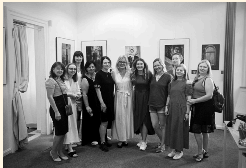
Project `Better jobs in CR`