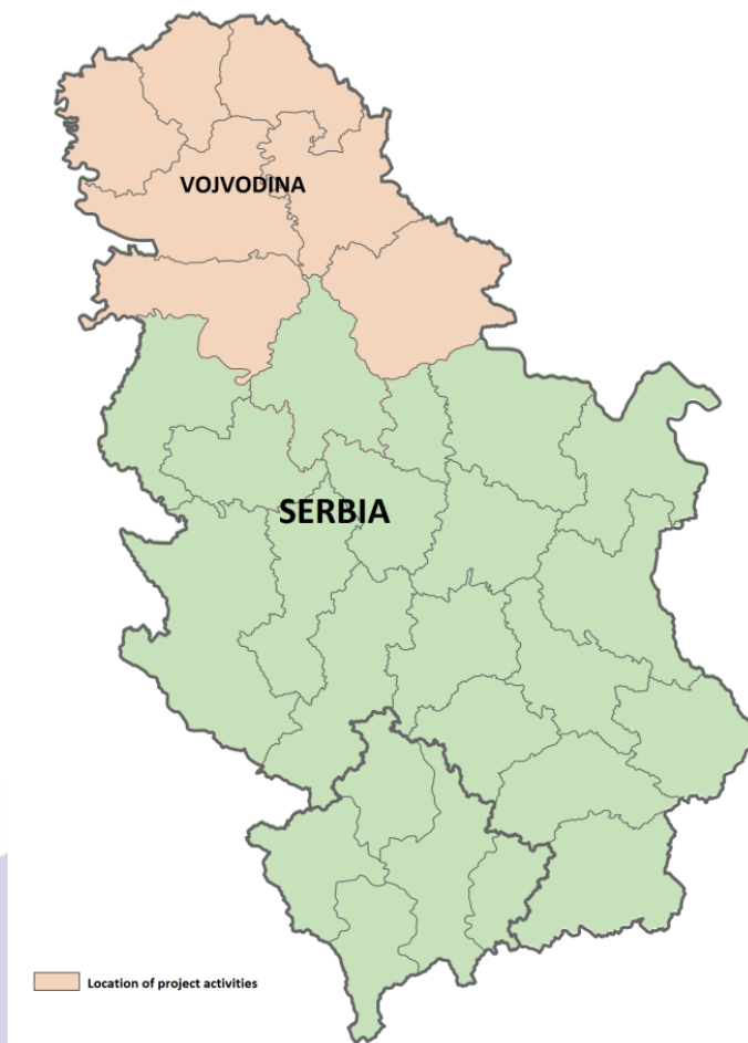
Map of the country and province showing areas of work